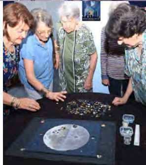
SOUTH AFRICA

“ This unforgettable event, held within the confines of the college, left all the approximately forty attendees mesmerized by the celestial beauty and its mysteries.