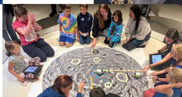
USA

“ The Moon is amazing and I love to share information with my elementary students through books and online resources in my library media lessons. Participating in events such as these helps me learn so that I can share my experiences with my students.