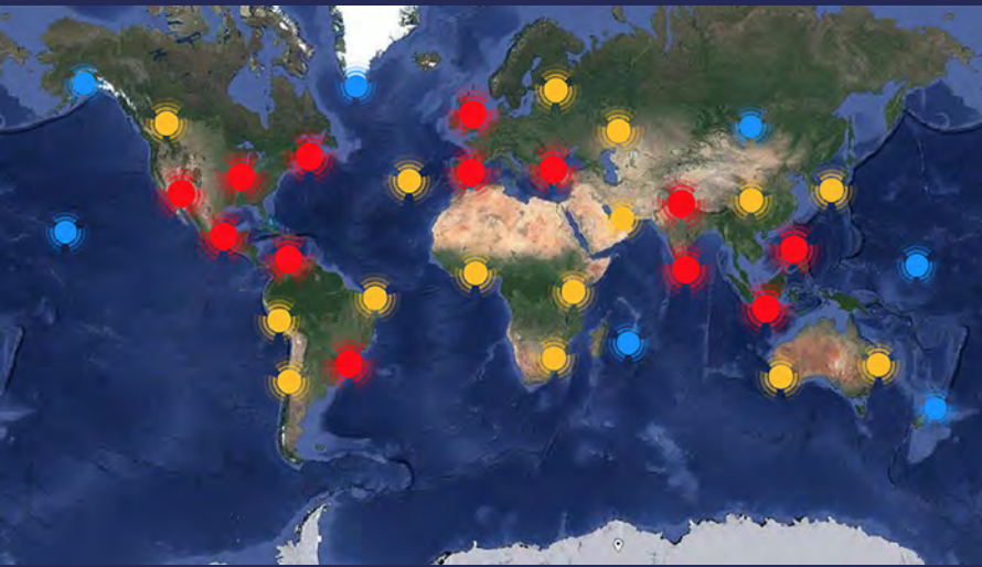
Number of registered locations: ● 101-1,000 ● 11-100 ● 2-10 📍 1