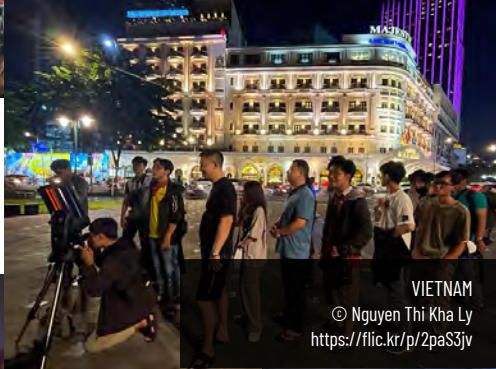
VIETNAM

“ It was as always amazing and fascinating experience for the observers and they were mesmerized by the close glimpse of the Moon and its surface features.